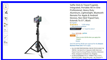
Amazon: Collapsible Tripod